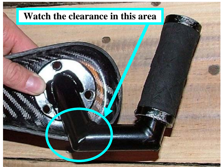
Figure 4: Reeder handle mounting location

8. Once all necessary holes are drilled and sanded smooth you can begin mounting saddle components. Proceed to the component assembly portion of these instructions.