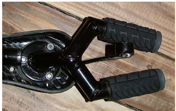
Figure 5: GB handle mounting location