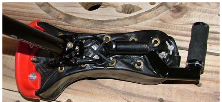
Figure 16: Completed air seat