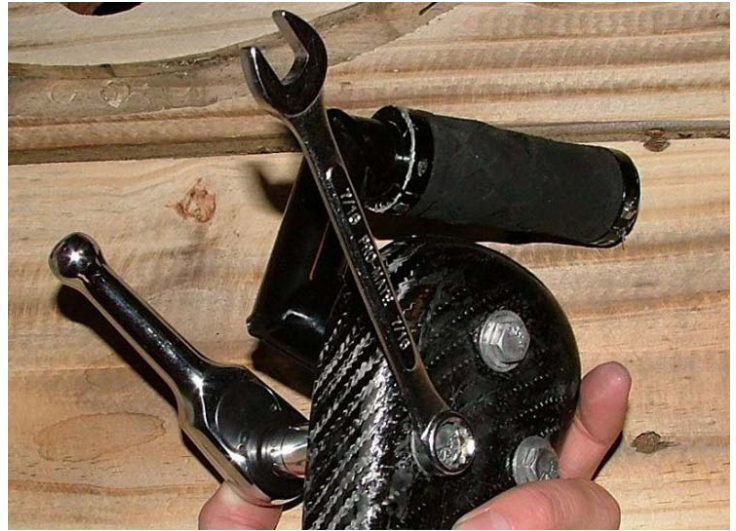
Figure 6: Tightening the handle bolts