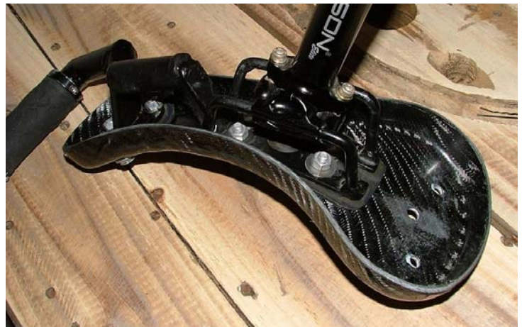
Figure 7: Seatpost and handle installed