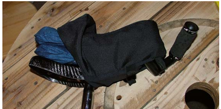
Figure 14: Assembling cover