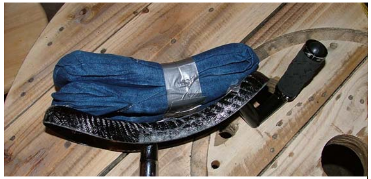
Figure 13: Air pillow on top of base

Congratulations, you have successfully assembled a unicycle air seat. Install the seat and go for a ride! The inner tube air pressure can be varied to suit your preferences. If the installation did not go as expected or you have any questions, please send an email to info@gb4mfg.com .