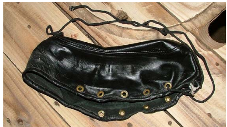
Figure 11: Leather cover with grommets