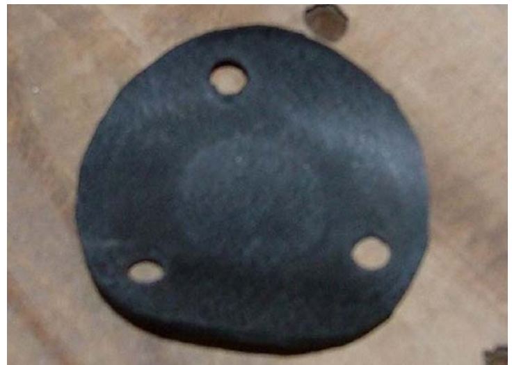
Figure 3: Rubber handle cushion