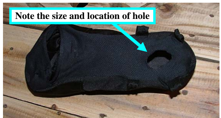
Figure 12: Nylon cover with hole cut for handle

Cut a circular hole in the front part of the thin lycra material on the underside of the cover, as pictured in Figure 12. The handle will later be fed through this hole. Both GB and Reeder handles will use the same size and location of hole.