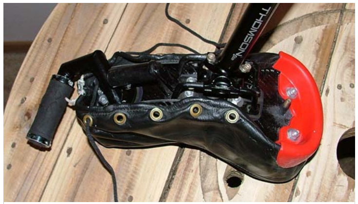
Figure 15: Cover installed