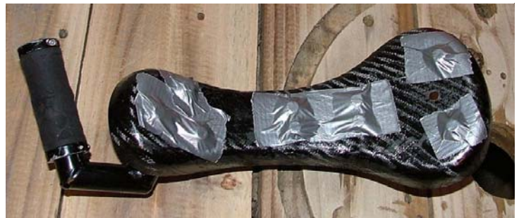
Figure 8: Tape over the bolt heads