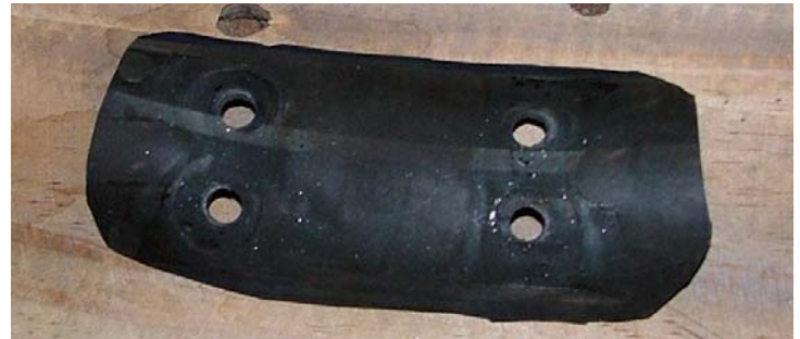
Figure 2: Rubber seat post cushion