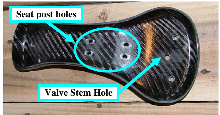
Figure 1: Carbon fiber base with all holes drilled