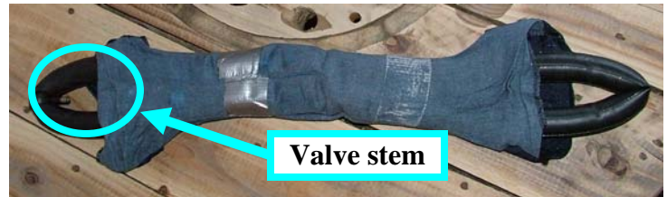
Figure 9: Feeding the tube through the pillow